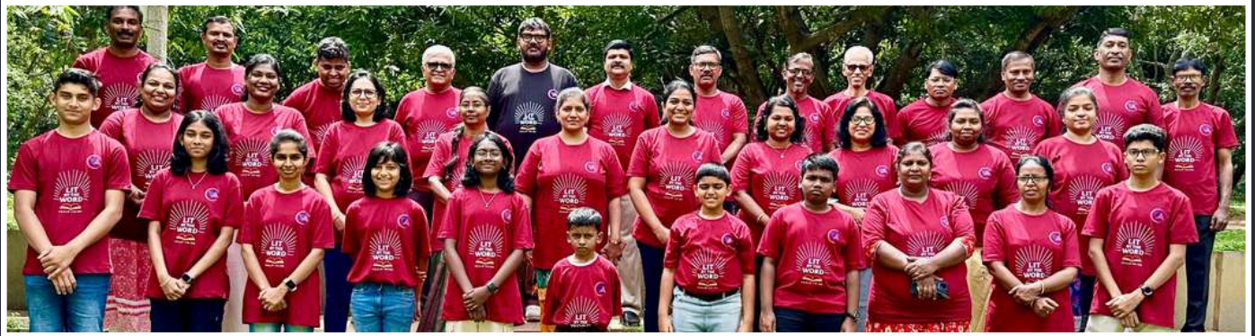
GODependence Team 3rd Family Get-together on 01 & 02 August 2025 @ Visthar Campus, Bangalore

More Details will be given in the next month issue.